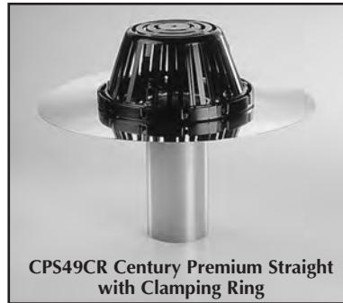
CPS49CR Century Premium Straight with Clamping Ring