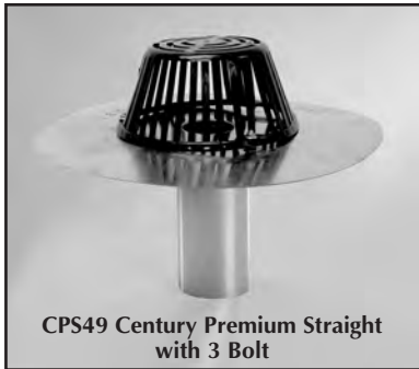
CPS49 Century Premium Straight with 3 Bolt