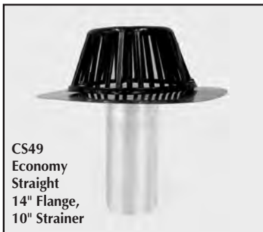
CS49 Economy Straight 14" Flange, 10" Strainer