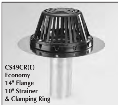
CS49CR(E) Economy 14" Flange 10" Strainer & Clamping Ring