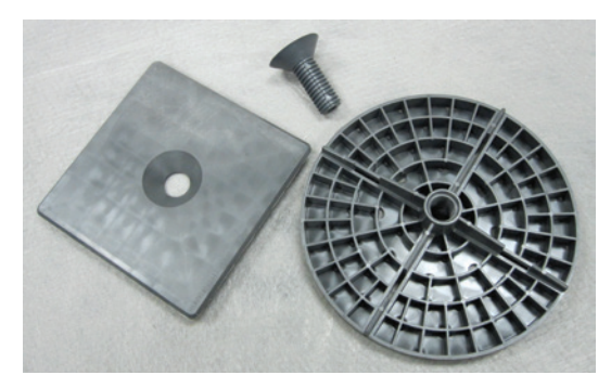
Guardian 3-piece Locking System

The Hanover Guardian Paver provides increased wind performance using a unique three-piece pedestal system and shaped paver. The three-piece pedestal system incorporates a top and bottom plate with a bolt, connecting the entire paver system together for superior wind performance. These pavers are 23½" x 23½" with thicknesses of 2" or 3". The 2" paver weighs 25 lbs per square foot and the 3" paver weighs 38 lbs per square foot for additional wind resistance.