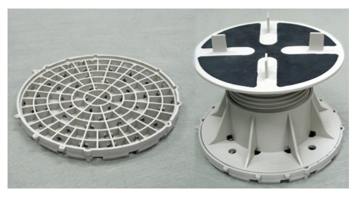
Hanover Compensator and Compensator with Elevator Pedestal

The Hanover Compensator is a specially designed tapered circular base for use with High-Tab and Elevator Pedestals. One compensator will provide up to 1/8" of roof slope compensation, allowing for a level paver installation. Multiple compensators can be combined to allow for additional roof slope.